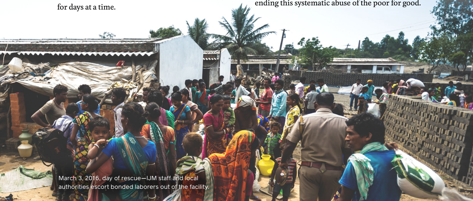
March 3, 2016, day of rescue—IJM staff and local authorities escort bonded laborers out of the facility.

IJM will support local police as they build the legal case against the kiln owner and the trafficking ring that helped him grow his business—hopefully ending this systematic abuse of the poor for good.