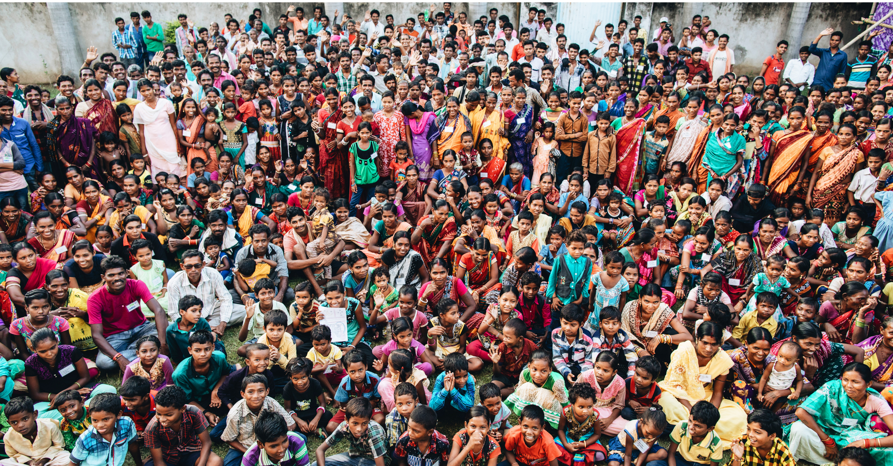
A group of survivors after graduating from IJM's two-year aftercare program.