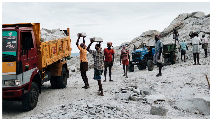
Rock quarry and poster photography by Katrina Sorrentino.